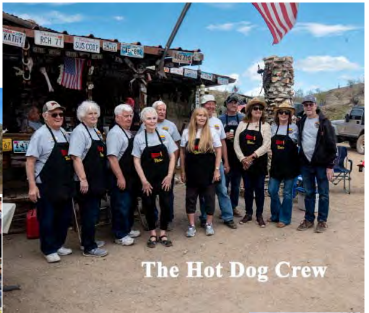
The Hot Dog Crew