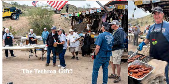
The Techron Gift?