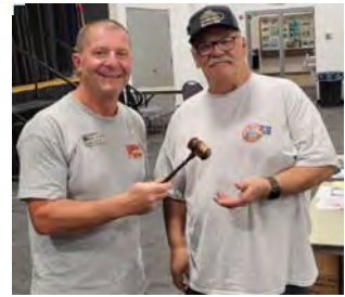
A successful transfer of power